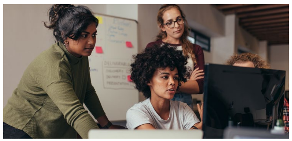
Image: Computer programming used to be dominated by modestly paid women

The five occupations across the EU with the largest skills shortages, such as information and communications technology (ICT) and nursing, are dominated by one gender and are projected to require increasing numbers of workers over the coming years (26).