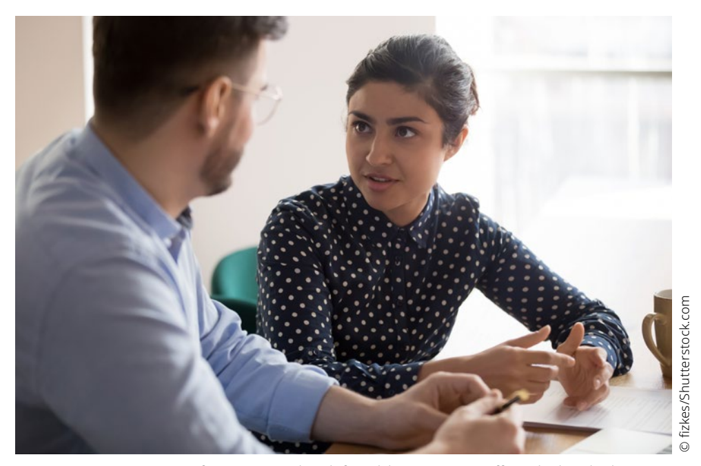
Image: Many instances of sexism can be defused by training staff to deal with the issue themselves

The European Court of Auditors has set up a working group on 'dignity at work' to provide guidance on how to deal with sexism.