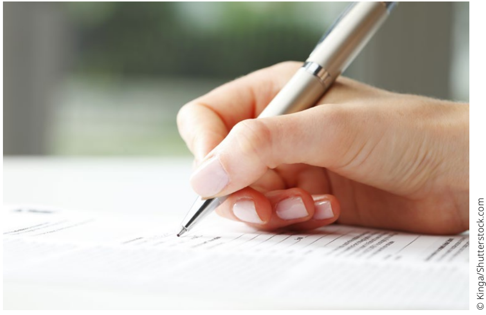
Image: Evaluators can tailor selection criteria to favour the qualities of the applicant of the preferred gender.

The impact of evaluators' unconscious bias in this study was lower selection ratings and compensation offers for women than for men (32).