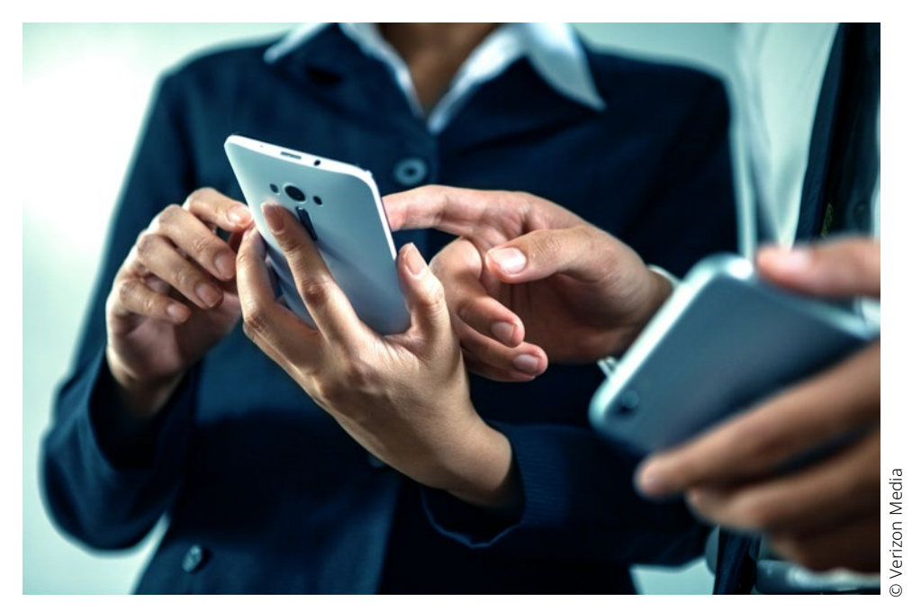
Image: Our minds act like 'predictive texters' to create stereotypes.

We are 'rule scavengers', seeking out laws in society to determine what characteristics we should display to fit in (17). The determination to create rules results in confirmation bias, where information that fits in with preconceived ideas is readily accepted, but information that challenges our beliefs is ignored (18).