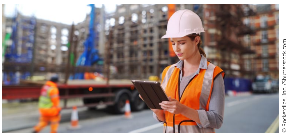
Image: Both women and men are more likely to face harassment in work contexts dominated by men.

Both women and men are more likely to face harassment in work contexts dominated by men (68).