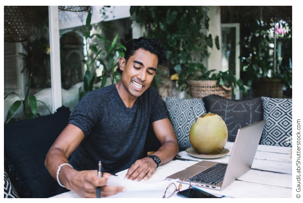
Image: If you find yourself with a sharp negative reaction to anything, check for biases that might have triggered that response.

If you find yourself with a sharp negative reaction to anything, check for biases that might have triggered that response. Discuss with a peer, mentor or coach to get feedback.