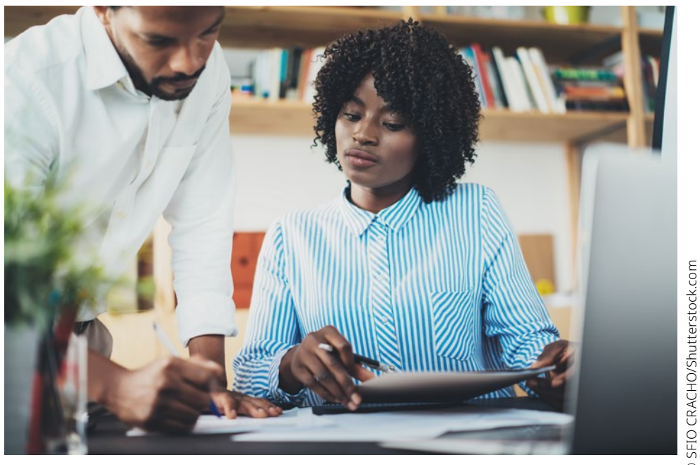
Image: You can test your own biases to ensure your understanding of sexism and sexual harassment.

You can test your own biases with the Harvard Implicit Bias Test, developed by the University of Harvard (https://implicit.harvard.edu/implicit/takeatest.html).