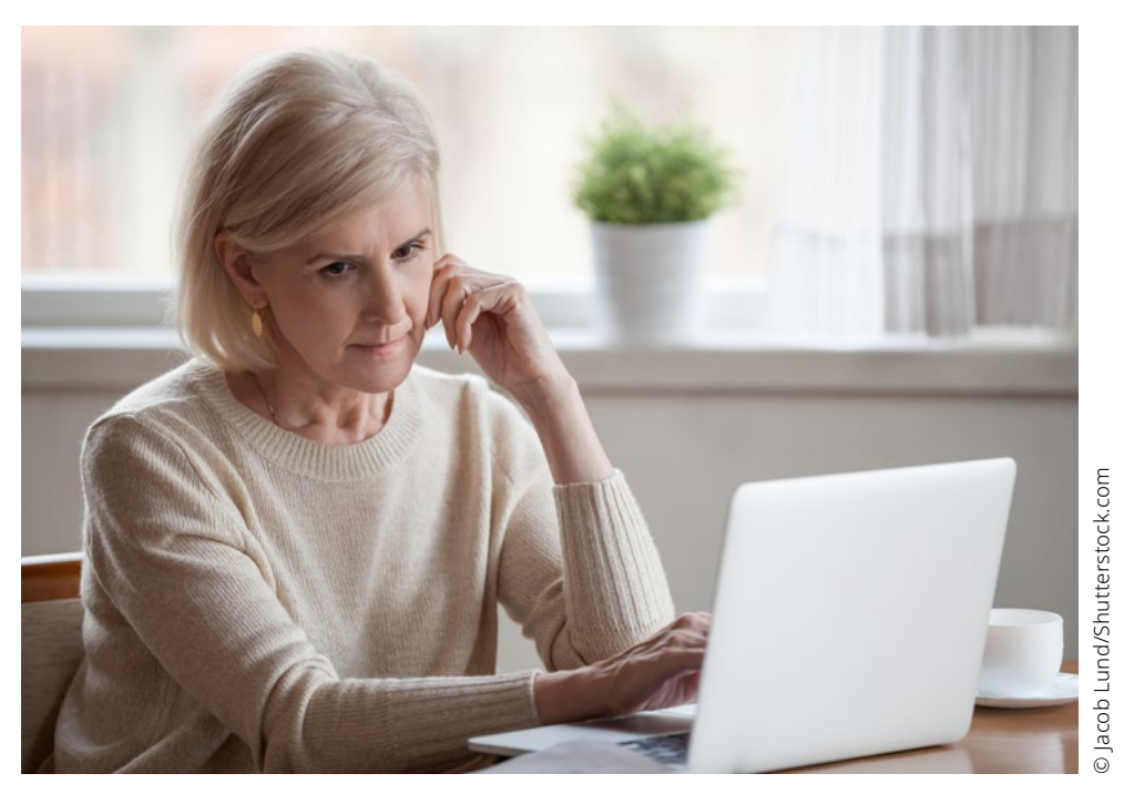
Image: Women apply in lower numbers to jobs advertised using adjectives such as 'aggressive' and 'competitive'.

Women also apply in lower numbers to jobs advertised using adjectives associated with masculine stereotypes (29). In one design company, when a job advert for the same role was changed from focusing on 'aggressiveness and competitiveness' to focusing on 'enthusiasm and innovation', applications from women jumped from 5 % to 40 % (30).