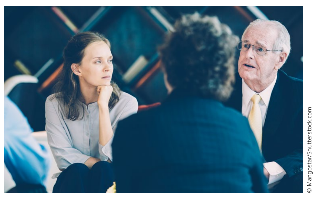
Image: Bystander interventions are important to create a culture where sexist behaviour is flagged up as unacceptable.

Remind the person who is behaving in a sexist way that this is against the policy of your organisation. It might be more appropriate to challenge the issue later, but the language should remain the same.