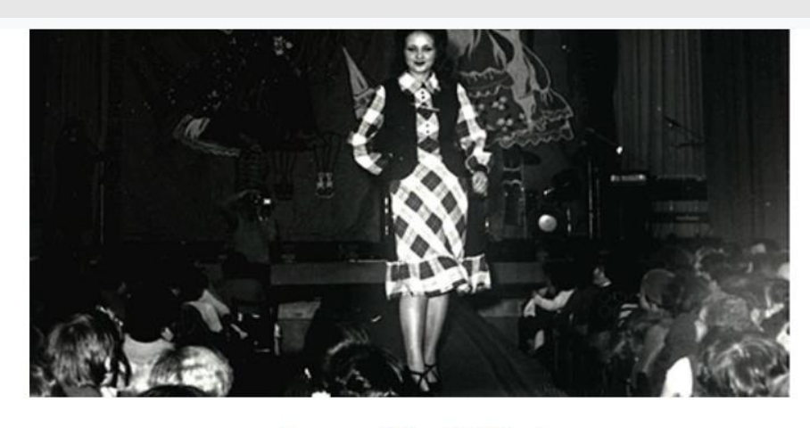
Ситцевий бал (1955 р.)